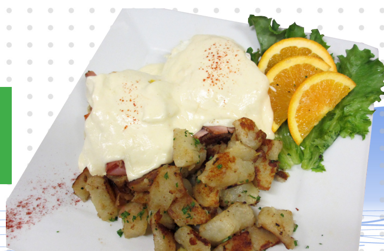
Eggs Mornay ... 9.50 Toasted English with grilled ham, two over easy eggs smothered with a Vermont Cabot cheddar cheese sauce, home fried potatoes