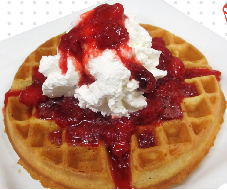
Strawberry Waffle ... 8.50 Sweet chopped strawberries & whipped cream