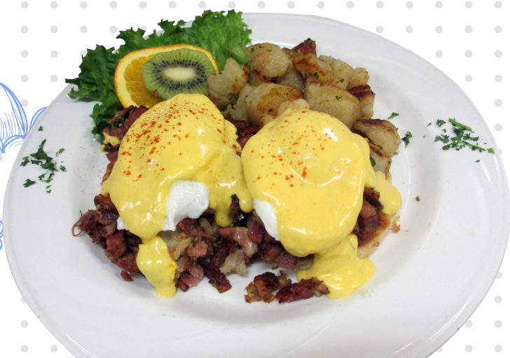
Irish Benedict ... 9.95 House corned beef hash in a toasted English muffin with poached eggs, hollandaise & home fried potatoes