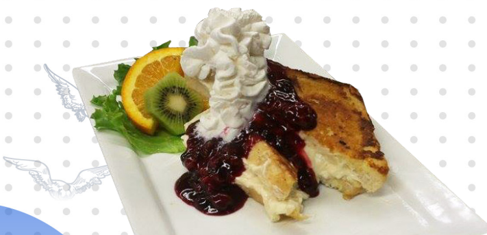
Berry Berry Stuffed French ... 8.95 Twin slices of fluffy French toast topped with berry berry sauce & whipped cream