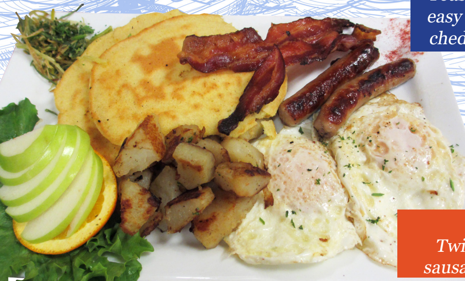
Sailor Sampler ... 9.95 Twin pancakes, two eggs over easy, two sausage links, two bacon slices, home fries