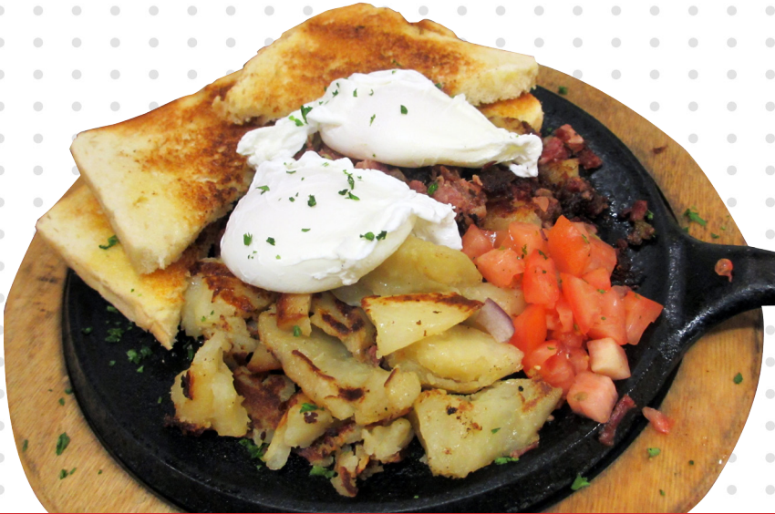
Hash Skillet ... 10.50 Hand cut corned beef hash with poached eggs & home fried potatoes with homemade toast