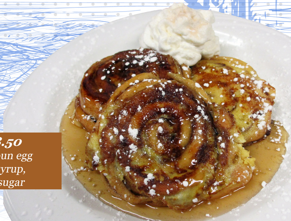
Cinnabon French ... 8.50 Slices of our gooey cinnamon bun egg dipped with Vermont maple syrup, whipped cream & cinnamon sugar